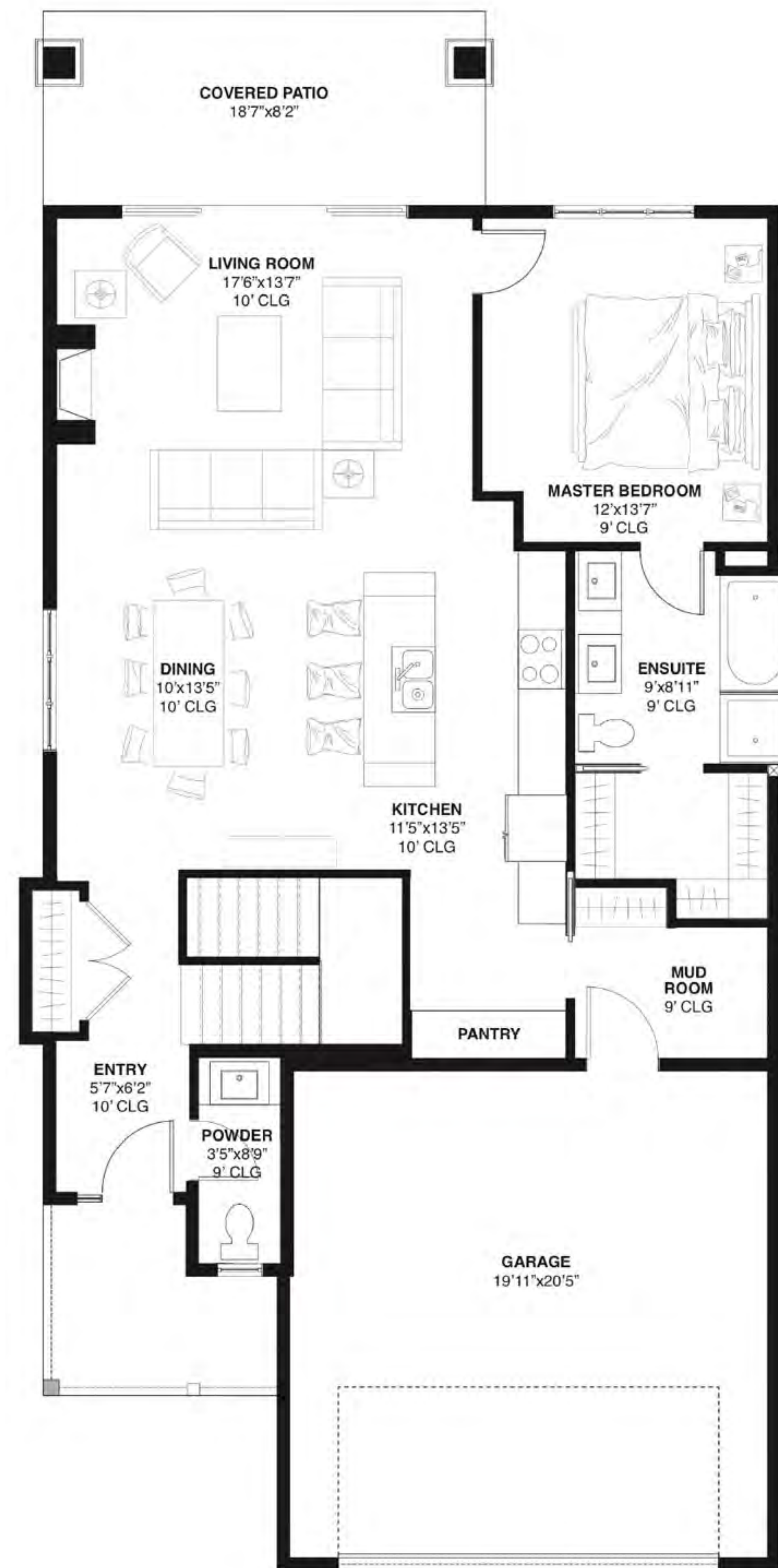
MAIN LEVEL 1,207 SQ. FT. + GARAGE 436 SQ. FT.

FINISHED 1207 SQ. FT. UNFINISHED 1134 SQ. FT. GARAGE 436 SQ. FT.